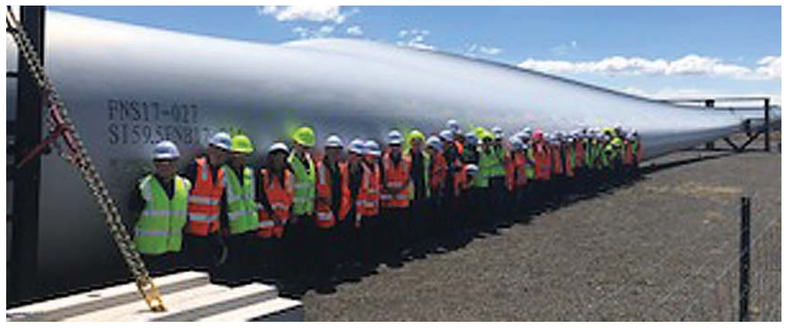
On Wednesday the 13th March, Stage 3 Indigo and Purple from Guyra Central School visited the White Rock wind farm, as part of their science unit, Essential Energy. They had a lot of fun exploring the turbines and the solar farm.

It was fantastic to see a total of 40 Partnering organisations attend Guyra Central School's 'Partnerships for Learning Celebration morning tea' which was held on Thursday March 14th.