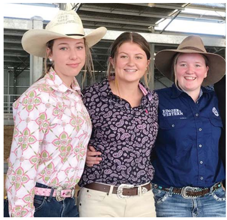
FUNDRAISING THIS WEEKEND:

The girls will kick off their fundraising this weekend with a