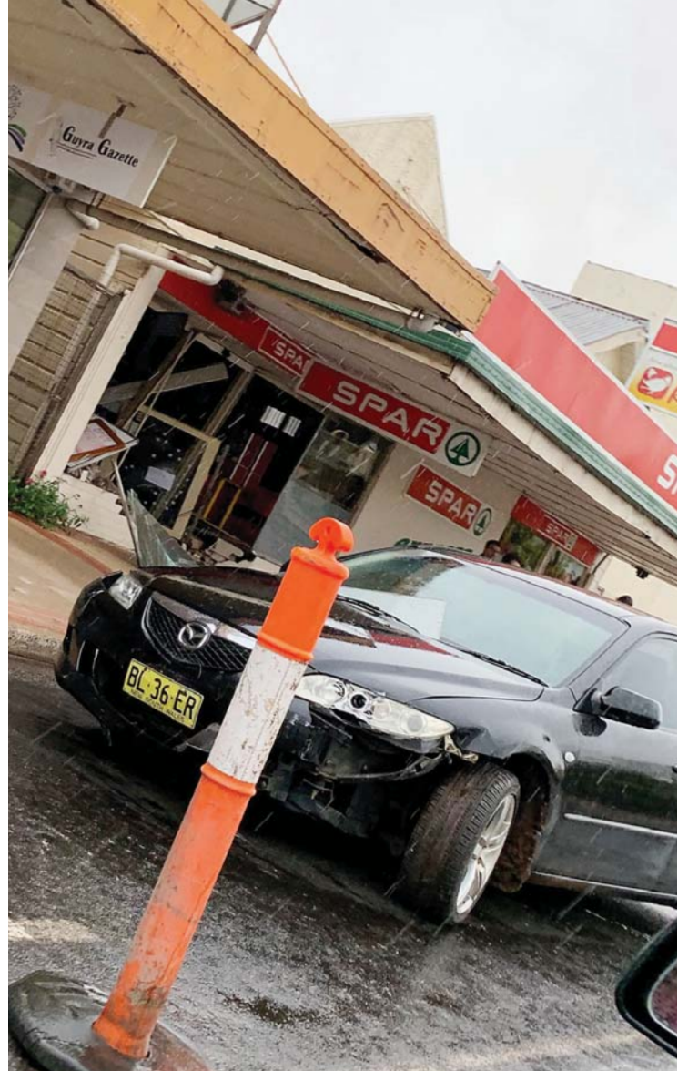
Spar Supermaket shortly after the vehicle was extricated from the front of the building

Anyone with information is urged to contact Armidale detectives on 6771 0699 or Crime Stoppers 1800 333 000.