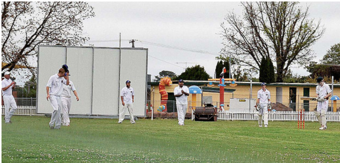
New sight screens were one of the items funded for Guyra's sporting community

The regional group replaces two subcommittees for the Armidale and Guyra districts,