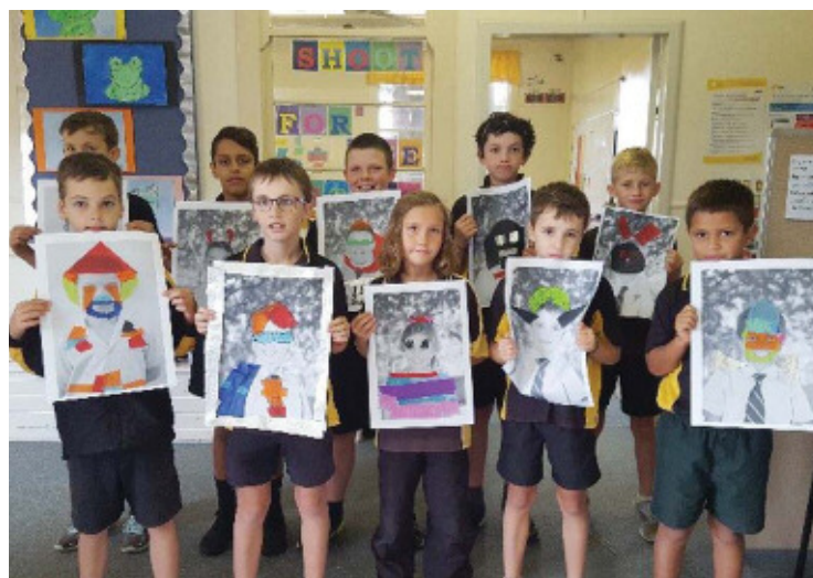
Students at Black Mountain are busy preparing artworks for the Guyra Show

Transition to Kindergarten continues every Friday this