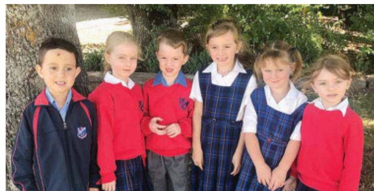
Bald Blair Public School (above)