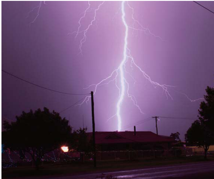
Lightning strike caught on camera on December 20th, 2018 taken from his home in Ollera Street.

The previous hottest month was January 1929 when temperatures reached or exceeded 28.0C on 19 days, and reached or exceeded 30.0C on seven days.