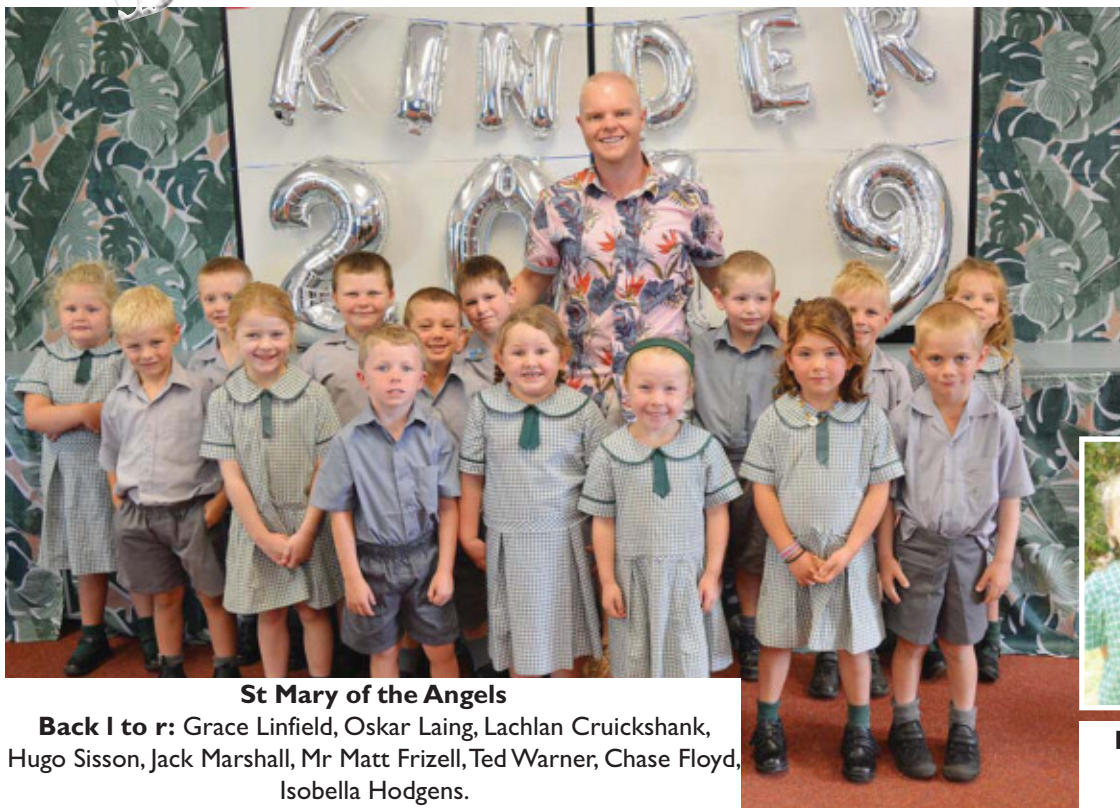
St Mary of the Angels