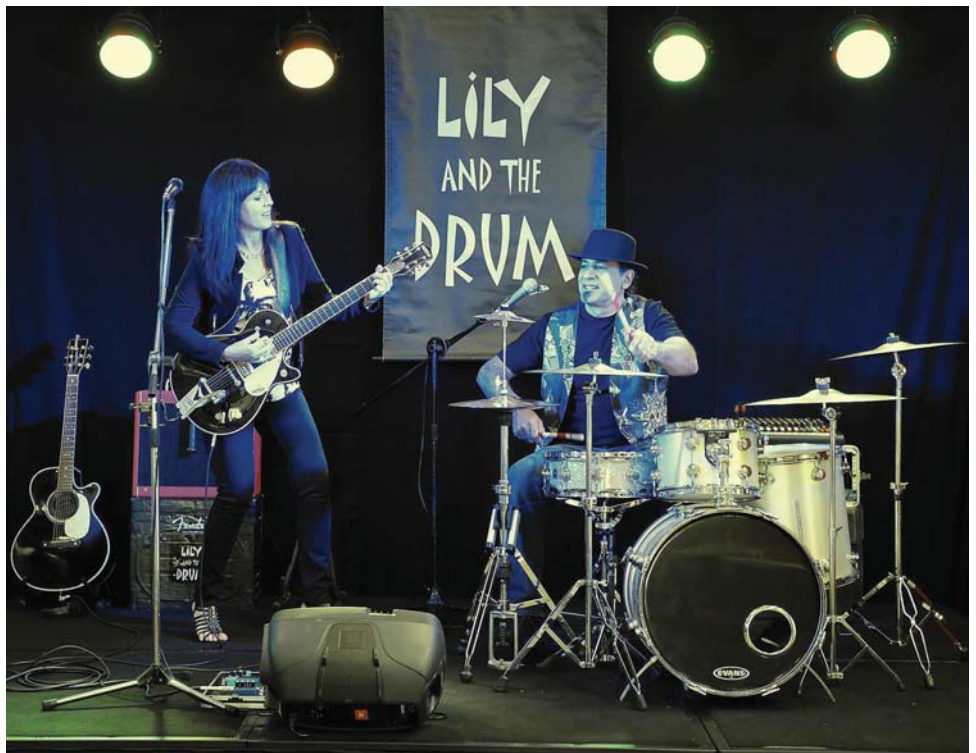
Lily and the Drum are a 'must see' act on Australia Day'

Their touring has led to them delivering over 700 live performances. They will be playing in the Regional Australia Bank Music Tent from 6pm until 9pm on Australia Day. We are really pleased to see them at the festival.