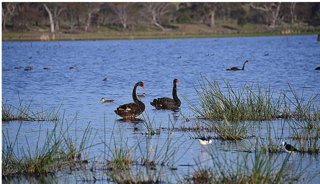
Little Llangothlin Nature Reserve is a hidden gem on our doorstep

"Little Llangothlin Reserve is internationally-recognised by the Convention of Wetlands of International Importance and we also believe it is something to be cele-