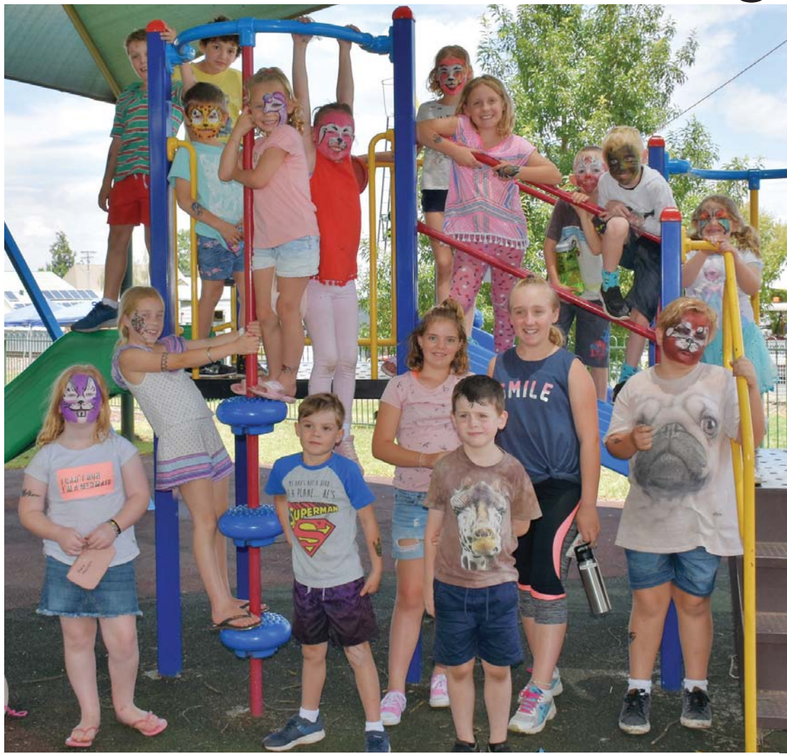
Enjoying a day out at the Festival on Tuesday were the kids from Vacation Care - they were kept busy getting their faces painted, making potato heads and colouring in at the Centacare stand. They also spent time at the playground before having a ride on the train and finished the day with an icecream.

The event wraps up on Sunday January 27th.