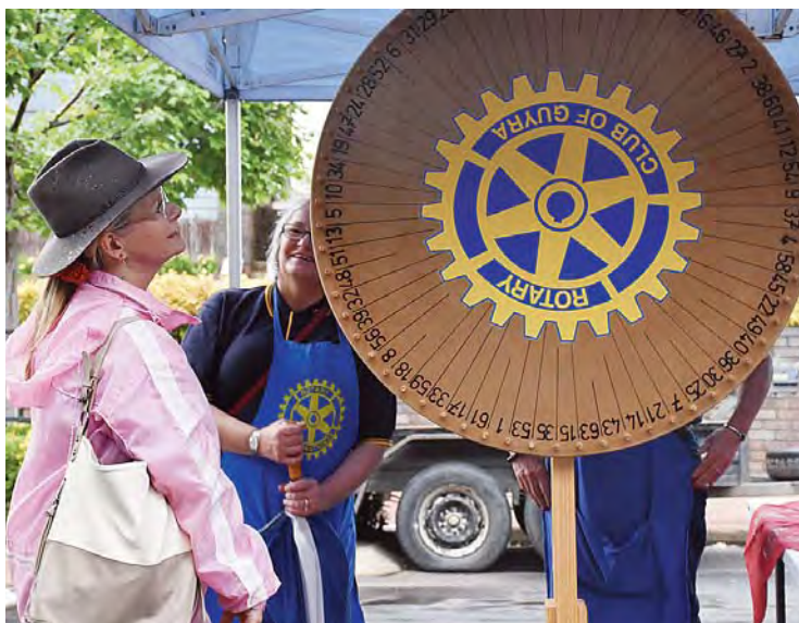
Try your luck on the ham wheels this Friday There will be a lot happening from around 5pm

Market stalls will be operating and you can try