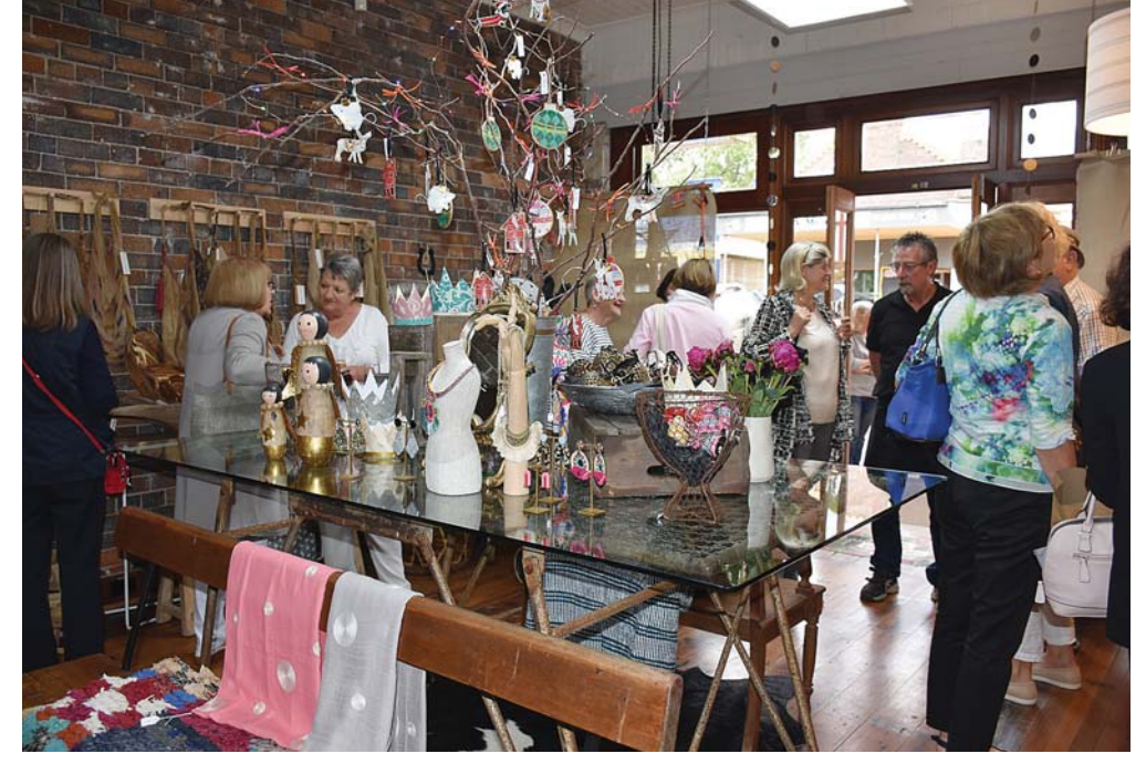
There were plenty of lookers (and buyers) on opening night)

"I feel we have lost a lot of the lovely eclectic shops we used to have in the region, not just in Guyra, and wanted to offer an alternative. It has been great to see people coming through the doors and enjoy what I have to offer."