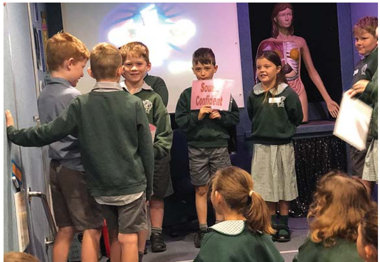
St Marys students in the van