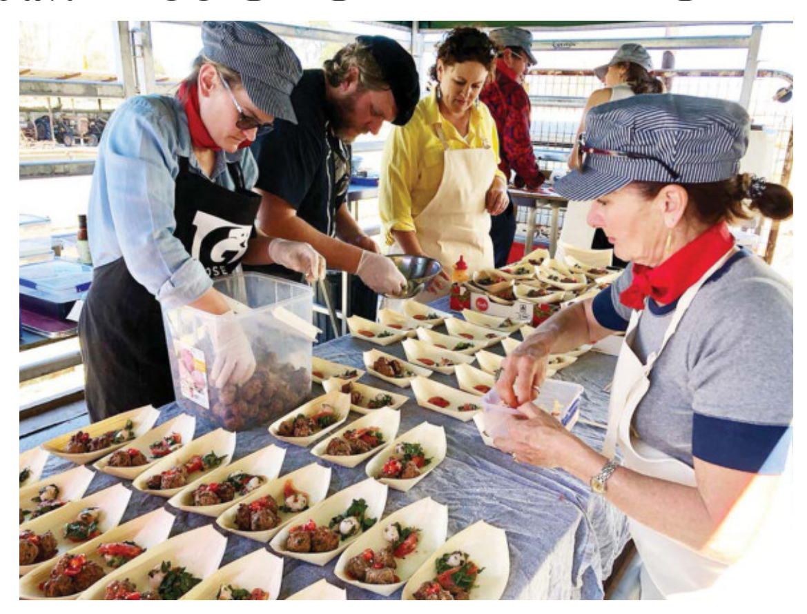
ber of Commerce, the Armidale Guyra Business Alliance, and Guyra on a Plate.

It was supported through the Guyra & District Cham-