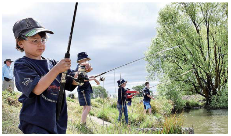
The Kids Fishing Clinic will be held at the Mother of Ducks Lagoon on Saturday September 29th from 9am

The focus of activities on Saturday September 29th will be a Market Day in Bradley St with a variety of stalls from across New England and a full program of music from Country and Western to Blues and Folk to Hip Hop. Food, wine tasting and beer tasting will