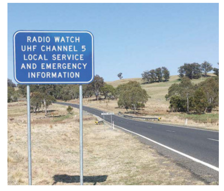
New road signs are in place advising motorists of the emergency channel

The repeater is accessible by ALL members of the public with a UHF CB radio for EMERGENCY purposes only. In the near future a community based organization called CREST will be sourcing volunteer members of the community to monitor UHF CB Ch. 5 repeater to provide a 24hr "Listening Watch" for