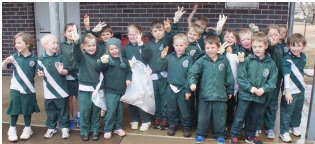
St Mary of the Angels Kindergarten students cleaned up last week

This term Kindergarten at St Mary of the Angels have been exploring the places they live in and belong to. They have identified what makes a place special and how this may differ for different people.