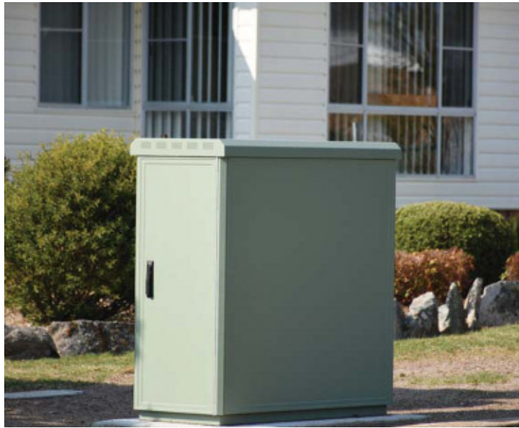
Guyra will be serviced by both Fibre to the Node (seen here in Wirruna St) and Fibre to the Curb

Guyra is being serviced by both Fibre to the Node and Fibre to the Curb technologies.