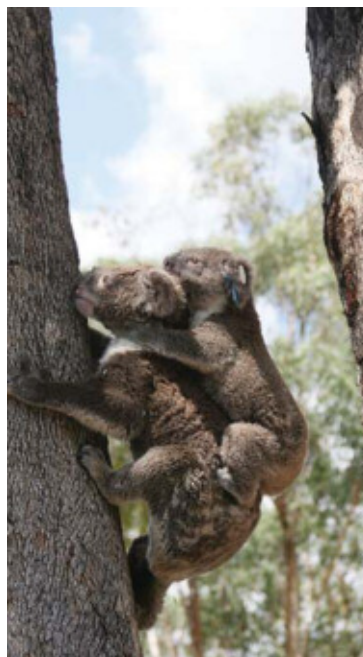
Mother and baby koala released back into the wild

“Our experienced staff can work with farmers to design appropriate projects critical to habitat conservation where species are at risk. An example may include planting koala friendly species as