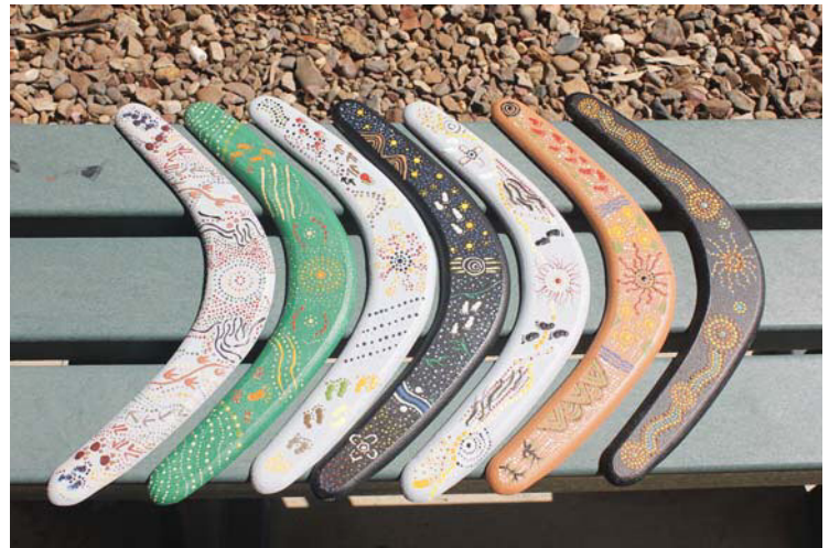
Boomerang painting and Jewellery making will take place during TroutFest on the October long weekend

The workshops have limited numbers, and numbers are needed by September 17th. There are only three places left for the jewellery workshop so book early to avoid disappointment. Planned photography and