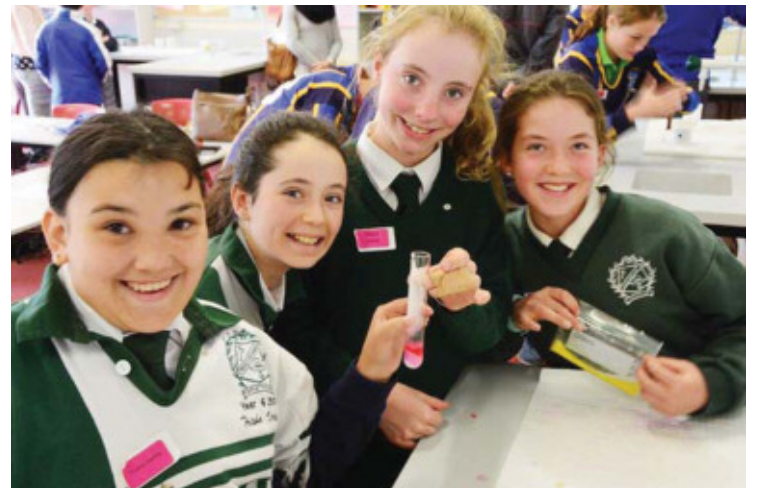
Students from St Marys enjoyed a range of activities designed to ease the transition to High School

In music, they played a variety of music and drama