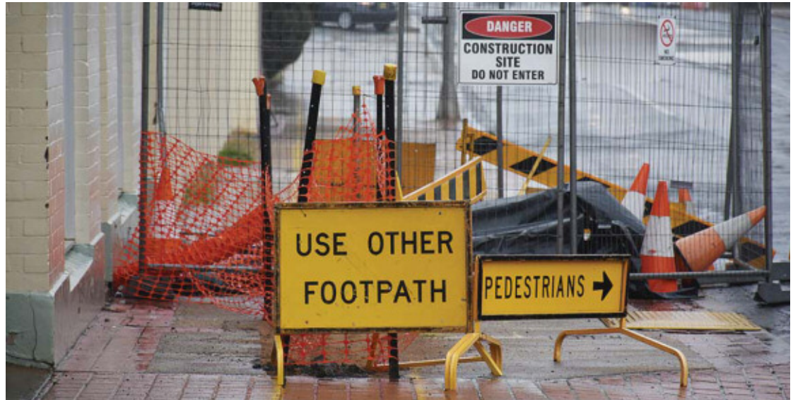
Work has stopped until council can decide how to deal with underground fuel tanks

"We will need to determine which tanks can be, or need to be, left in place or if any need to be removed for the reconstruction to proceed.