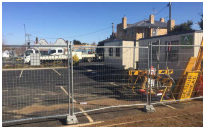
A work compound has been established in the Guyra main street for the reconstruction.

One set of tanks was exposed last week, at the same time as Council completed other preparations for the main street upgrade. Council crews had begun preliminary works on the main street upgrade on 16 July, including initial test excavations to