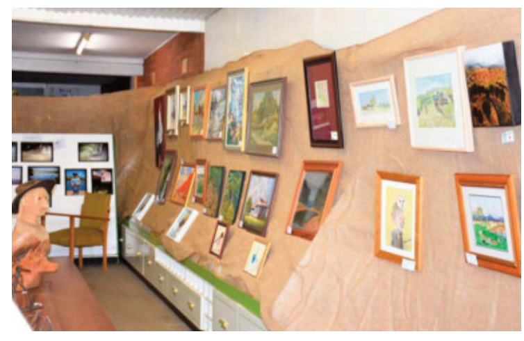
The Art competition was one of the success stories of last year's troutFest will be even bigger this year

A new feature will be a series of workshops run by local and other New England artists covering oils, water colours, pho-