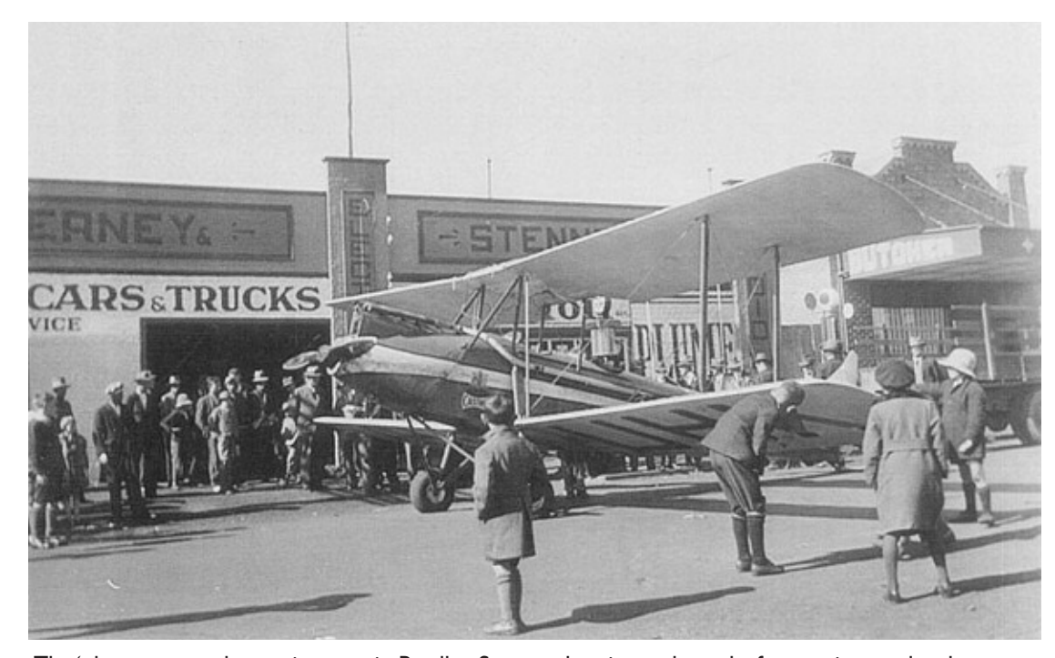
The 'plane attracted great interest in Bradley Street, when it was brought for repairs at a local garage, Tierney and Stennett's, which is now occupied by Dragonfly Plumbing, next to T & A Meats