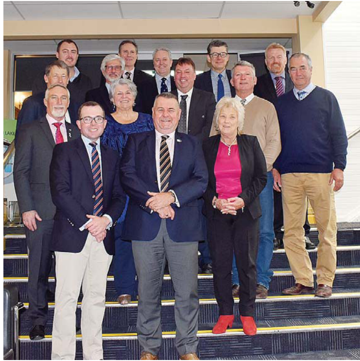
Mayors and General Managers of the New England Joint Organisation at the meeting in Moree

"The group will now be able to prioritise and plan strategic development, including in infrastructure, share re-