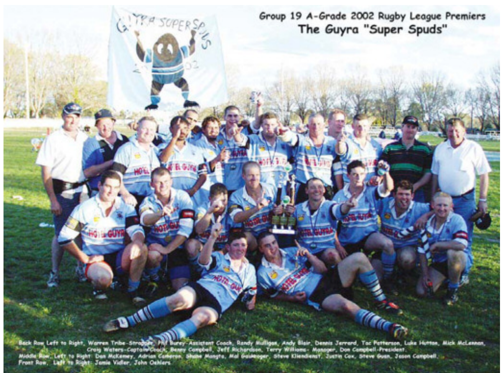
Group 19 A-Grade 2002 Rugby League Premiers The Guyra "Super Spuds"

The Golf Ambrose set down for last weekend was a wash out and has been rescheduled for July 22nd – plenty of