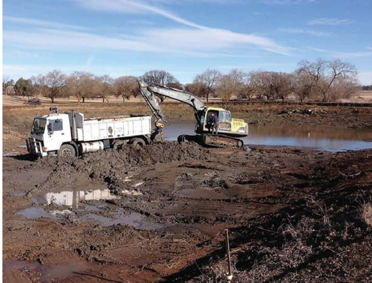
DIRTY WORK: Cleaning out the 10th dam at the golf course. The dam is already full again after the recent rain