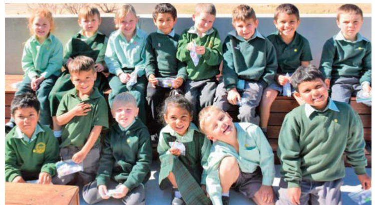
Black Mountain students enjoyed their visit to the library

tures on the big screen, and to show Cr Murray their fin- also enjoyed the opportunity ger puppets.