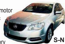
CALL IN & INSPECT 2013 HOLDEN VF COMMODORE EVOKE

Our business is built on Trust, Honesty, Great prices & Quality Used Vehicles