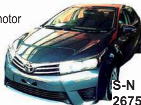
TEST DRIVE TODAY 2014 TOYOTA COROLLA ASCENT SEDAN