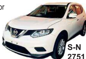
2016 NISSAN X-TRAIL ST 7-SEATER