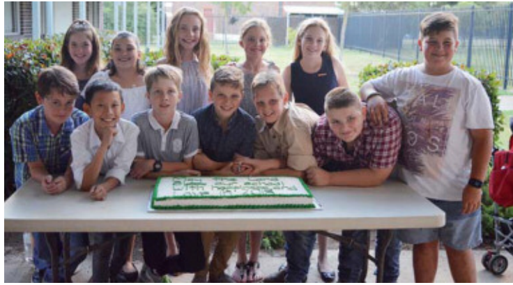
St Mary's school leaders for 2018

Our shared approach to leadership ensures that all students get to experience leadership opportunities and to represent our school at various events throughout the calendar year. Our Year 6 school leaders for 2018 are: