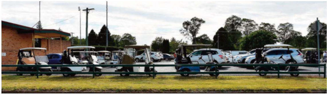
There were more carts than cars last Tuesday when Veterans golfers descended on Guyra for Pennants Day