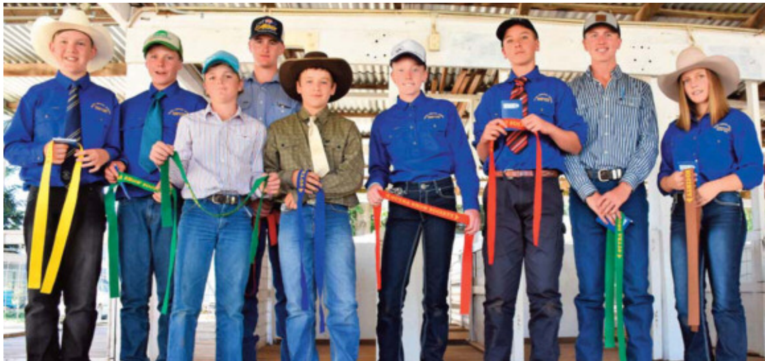
Guyra Central junior sheep judging ribbon winners at the Guyra Show