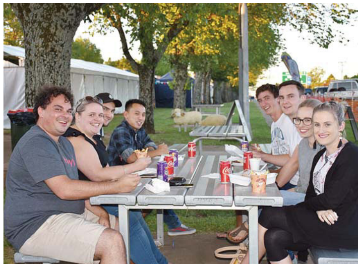
Enjoying an evening meal at the Festival