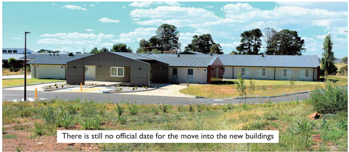
There is still no official date for the move into the new buildings

The new $7.5 million facility is located next to the Guyra hospital building, replacing