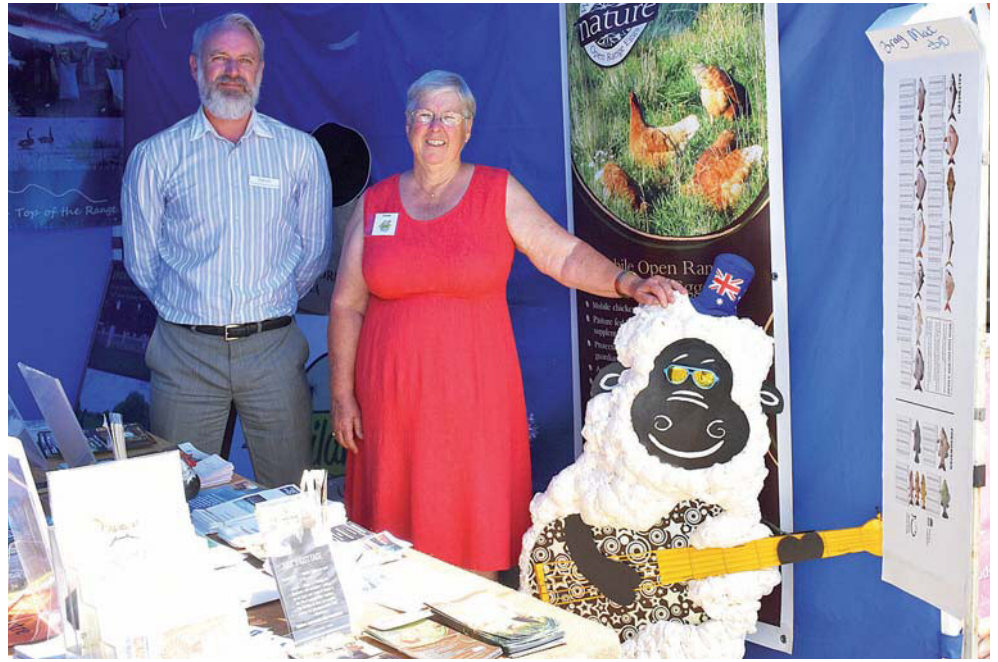
Armidale Regional Council and the Chamber of Commerce teamed up to promote Guyra at the Lamb and Potato Festival

The bus tour run by the Chamber was a huge success and included two tag-along cars to cater for last minute