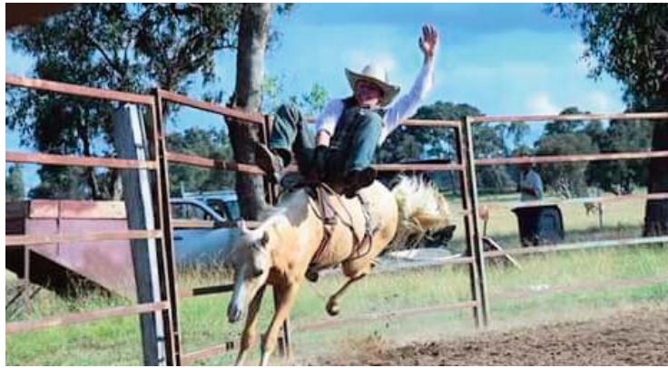
Above: Bucking Pony Golden Boy will be at the Guyra Show Below: True Grit will be in action at the Bull ride

Entries are now open and for all entries and enquiries please call 67794597.