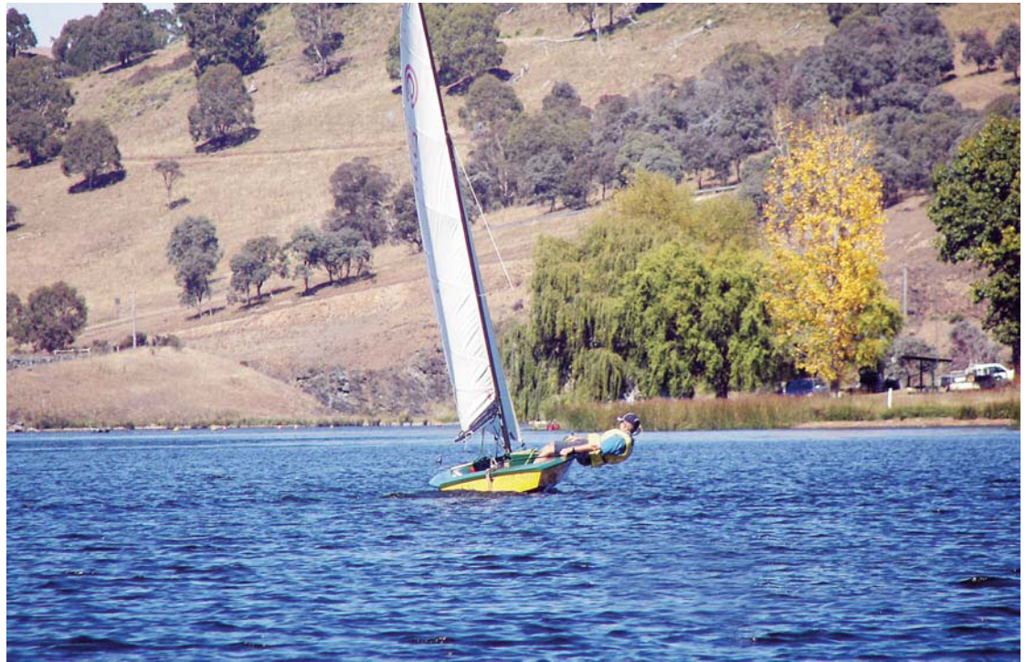
Dry times at Malpas Dam (file photo)

Northern Tablelands MP Adam Marshall has been lobbying for funding, seeking $10.5 million from the NSW