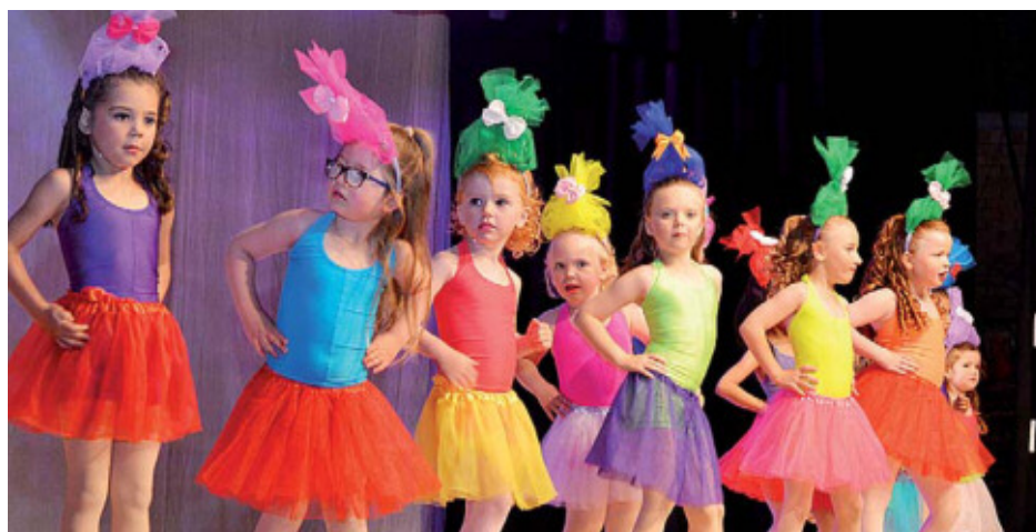
Guyra Creative Trolls