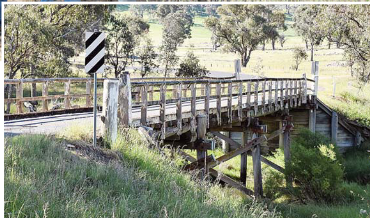
Right: The future of the old bridge is yet to be decided