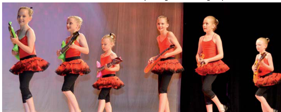
Guyra Junior Tap