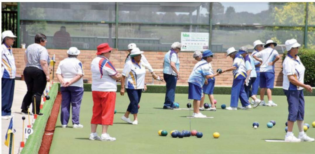
Nineteen teams took to the greens on Tuesday, contesting the Open Women's Triples.