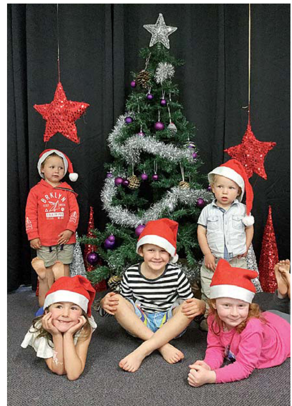
Preschoolers are starting to feel the excitement in the lead up to Christmas

The whole community is invited to be a part of the celebration and enjoy the evening of activities.