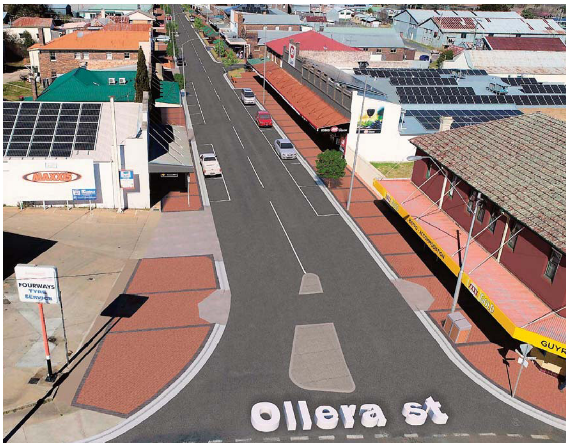
The plans can be viewed at the Guyra Council Chambers until the end of the month

"If we only get complaints it won't achieve anything - what we want is positive suggestions about what the community would like to see."