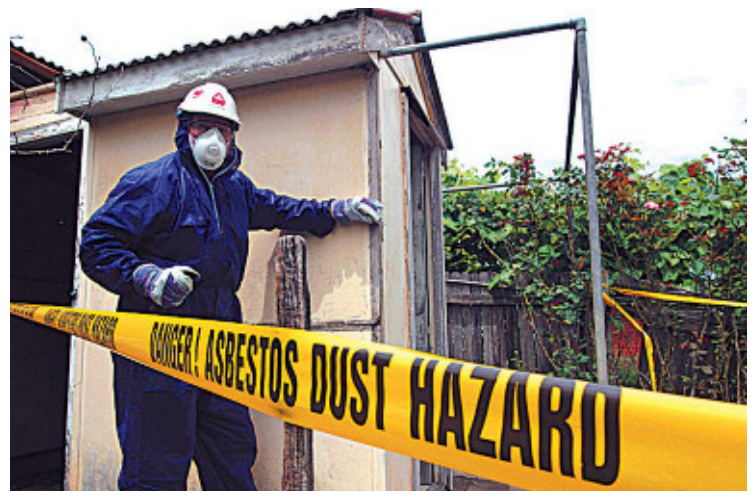
When Renovating, Go slow - Asbestos - it's a NO go! Visit asbestosawareness.com.au - To learn what you need to know!

"It can be in any home built or renovated before 1987; lurking under floor coverings including carpets,