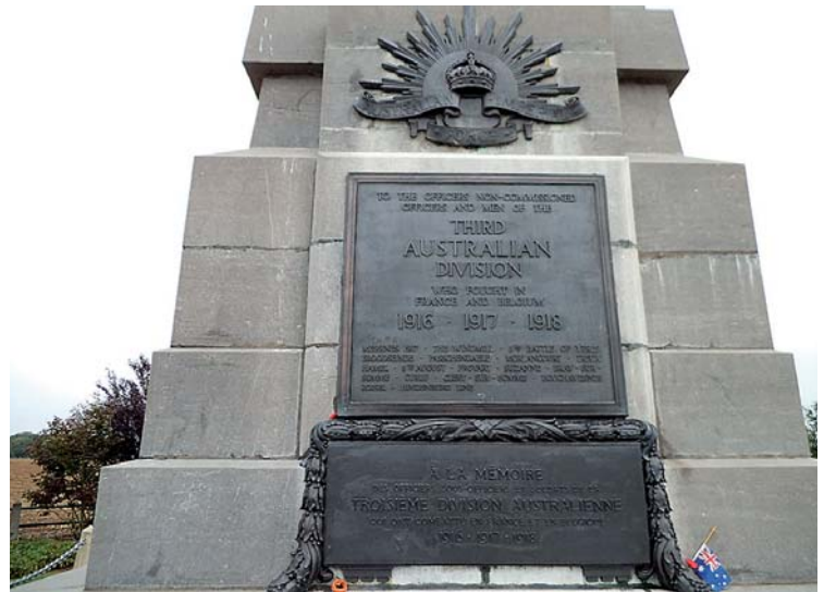
3rd Australian Division Memorial at Sailly-Le-Sac France

During the First World War, red poppies were among the first plants to spring up in the devastated battlefields of northern France and Belgium. In soldiers' folklore, the vivid red