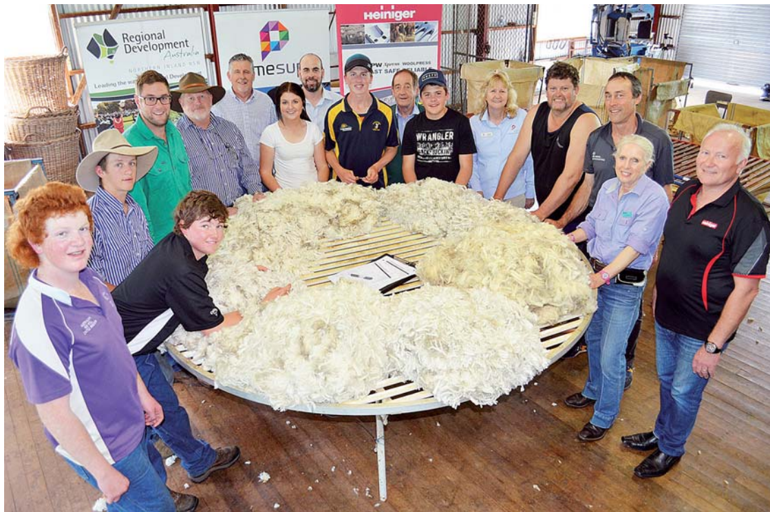
Guyra Central School students and those involved in the Wool Works Shearing School trial at Glen Innes.

"Keeping quality young people in the bush, providing them with opportunities to learn and work where they live should be top priorities for all communities across the region," he said. "The students that participated in this trial are a real credit to their