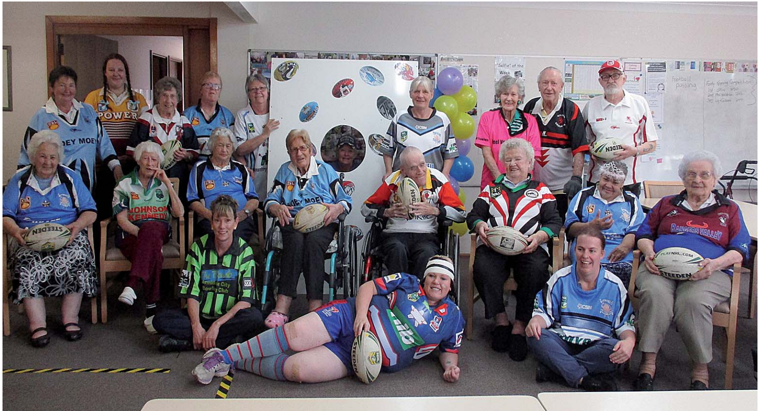
Above: Kolora presented winners of this year's "Footy Tipping" competition with trophy's and prizes for 1st, 2nd, 3rd and last place. During the morning, they played a football passing game and had a guessing competition and lucky door prize. They finished the morning with a Party luncheon.