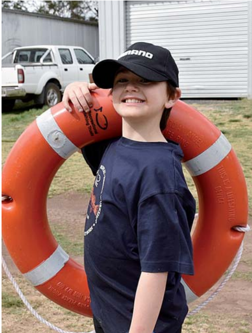
Ready to rescue