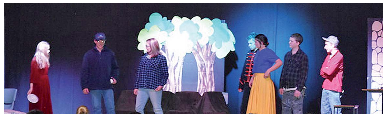
Year 9 English play: Snow White Lite

"I would like to thank the teachers and students for their efforts both on the night and leading up to the Creative Arts night."