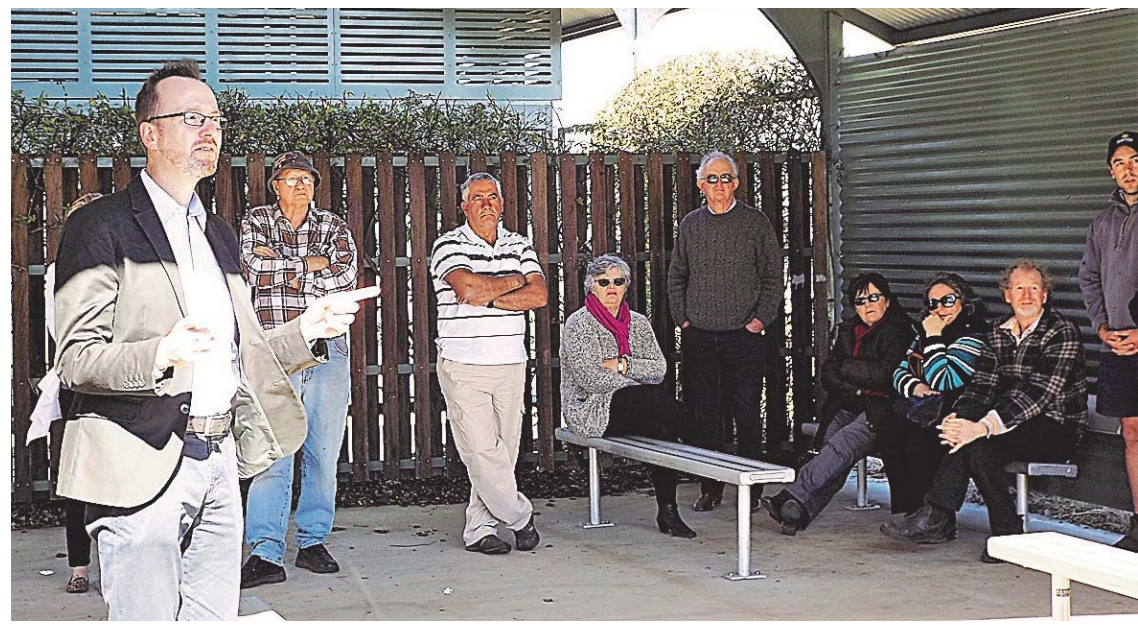
Greens MLC David Shoebridge talks up the chances of a de-amalgamation following the 2019 State Election

"Guyra was already co-operating by sharing staff, plant, and equipment with Armidale, so there was very