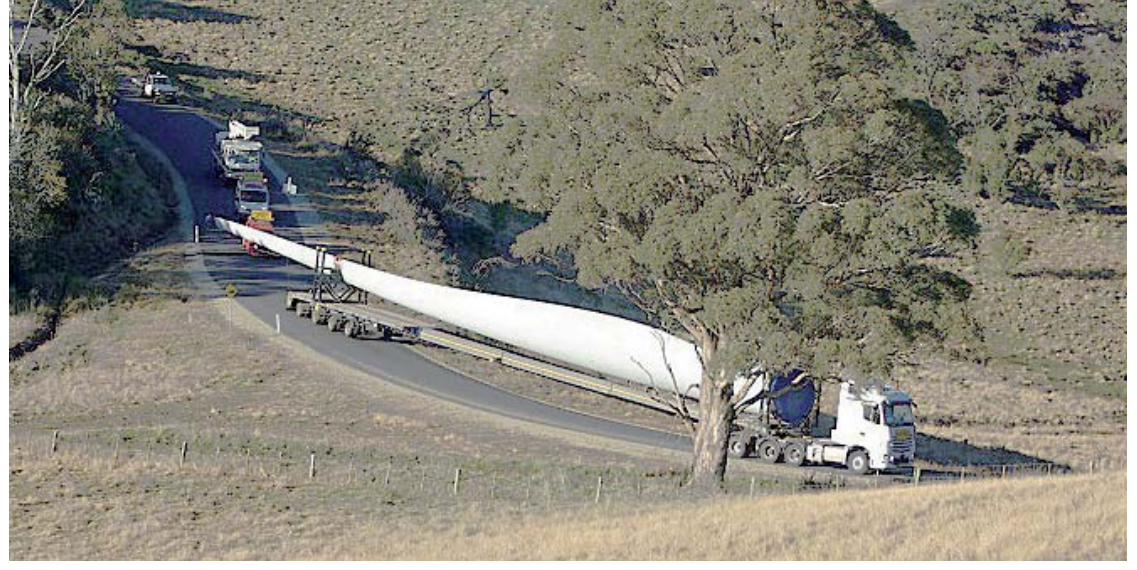
One of the blades negotiating the bend at the foot of the Gap Hill on the Maybole Rd

Residents have reported that there have only been minor delays, with deliveries being timed to avoid peak travel times and school bus schedules.