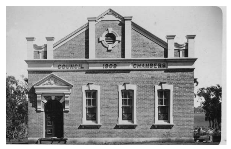
The Guyra Shire Council Chambers (above) built in 1909. The premises were extended in 1954. In 1981 the council moved into new premises. The building was handed over to the Historical Society in 1988 to use as a Museum

"Now that we have had a number of new volunteers put their hands up to staff the museum we hope to be able to open every weekend as well as Wednesday."