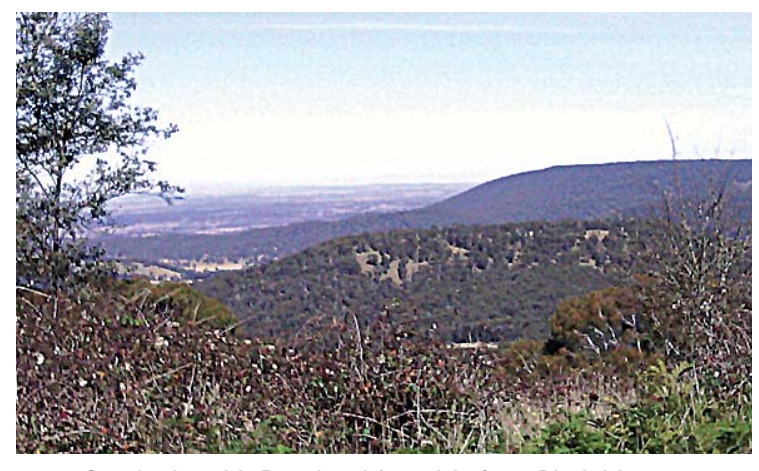
Overlooking Mt Duval and Armidale from Black Mountain.

Many of the small and larger settlements are partly the result of tonnes of Gold, Tin, Antimony and Molybdenite found locally. From the 1860's, (possibly earlier in some places), after leading geologists from Europe sampled some local 'dirt', the fever hit, the rush was on and the flood gates burst open as thousands of Europeans, Asians and seasoned cowboys from America's Wild