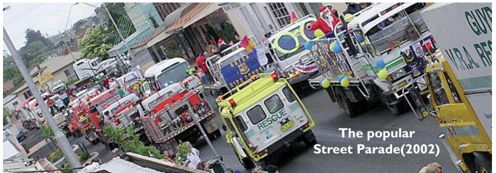
The popular Street Parade(2002)

tinue with the emphasis on safety would mean a change in how the carnival is put together and run and that is a task club members feel that they can no longer manage.