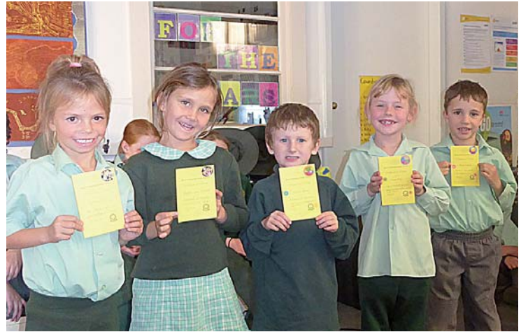
Award winners at school assembly

Student achievements in sport, music, reading, writing, science, mathematics, leadership and other areas of learning were recognised last week at our school assembly. Many parents joined us for our assembly to celebrate student achievement and share in their children's learning. Both junior and senior students shared writing they had completed, employ-