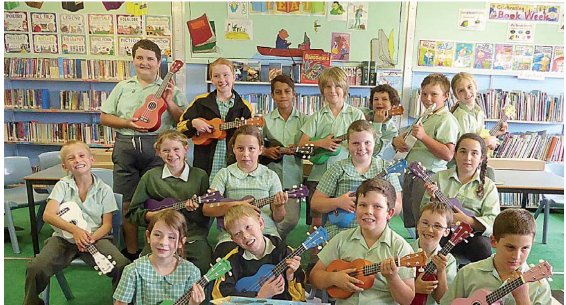
Years 3-6 at Black Mountain playing their ukuleles.