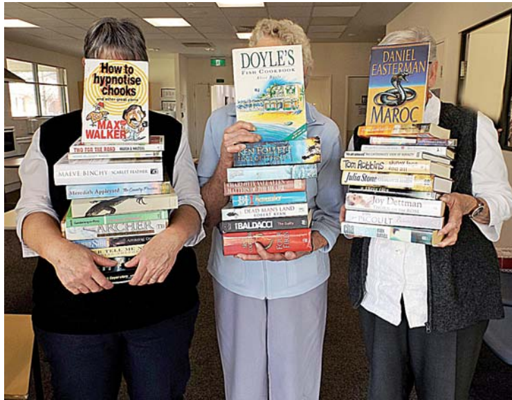
Newer titles, popular authors and hard to find books will be for sale at the Guyra MPS in June

“We really appreciate the generosity of the community who donate their pre-loved books and also appreciate the support from people who come