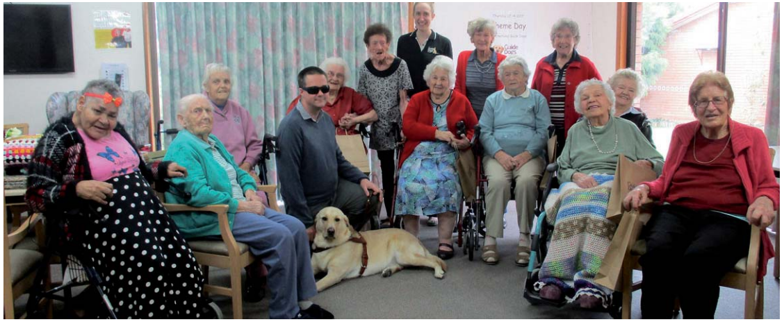
Kolora residents with special visitor "Sienna" the guide dog

The Guyra Library hosted a dozen residents from the Kolora Hostel for a morning tea and book reading as part of a new regular Library initiative.