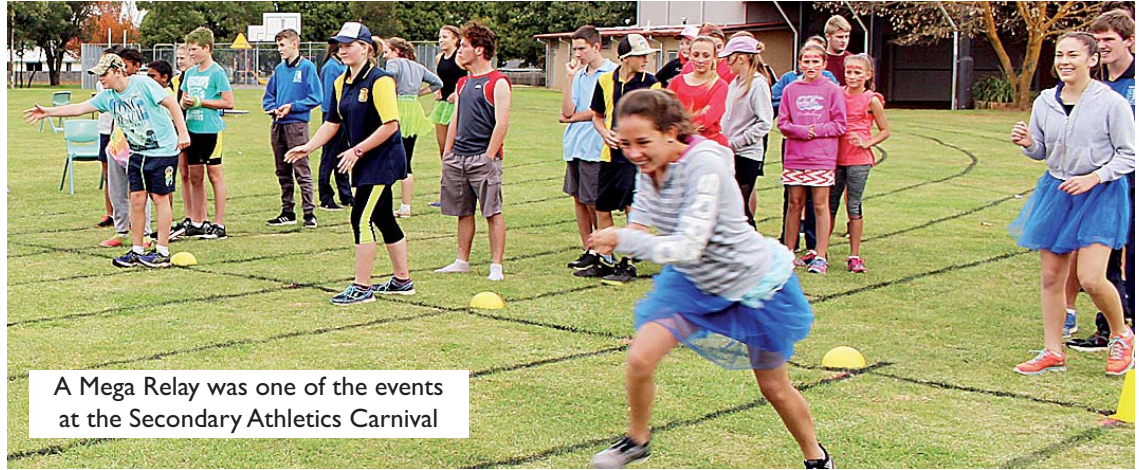
A Mega Relay was one of the events at the Secondary Athletics Carnival

Congratulations to the winning house Nincoola.