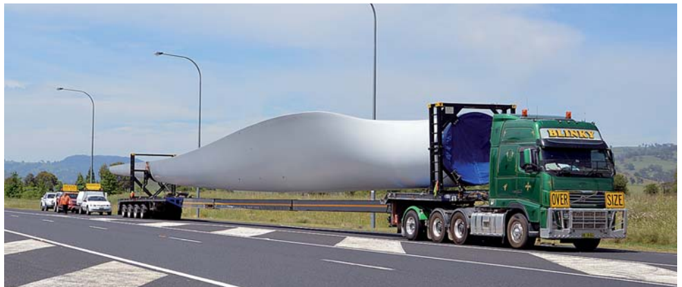
Ben Lomond residents met with White Rock Wind Farm representatives to discuss concerns over the wind turbines being transported via the Ben Lomond Rd

It is anticipated that two or three wind turbines will be delivered on the Ben