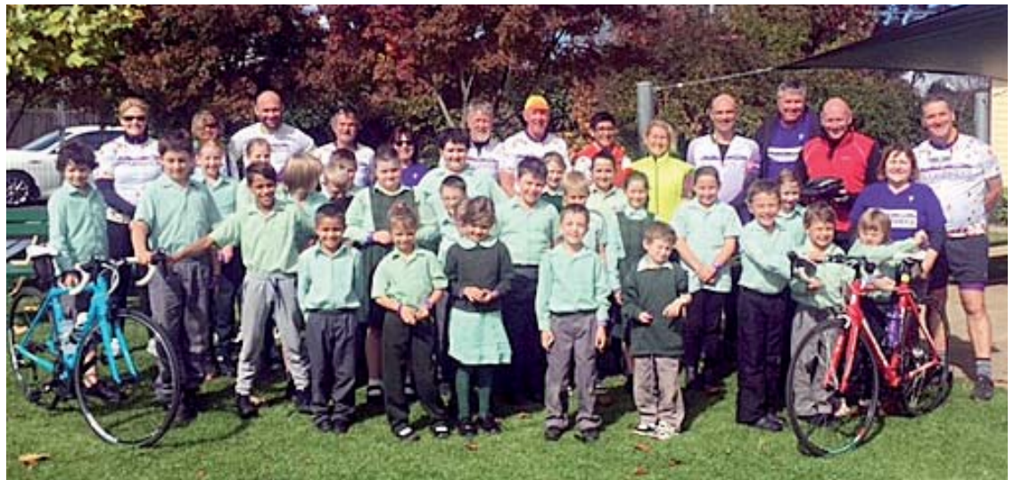
Black Mountain students enjoyed a visit from riders taking part in the Bridge to Bridge ride

Gubi Gabun Children's Mobile Service has returned to Black Mountain, running a Children's Playgroup every second and fourth Tuesday of the month. This is a wonderful opportunity that allows children to learn about school, make new friends and engage