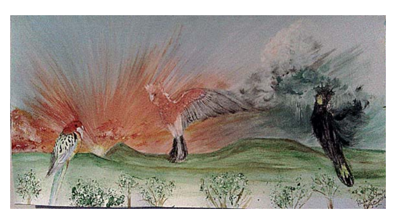
Birds of the Plateau (Richard Stanley)

townships/villages is a unique experience.