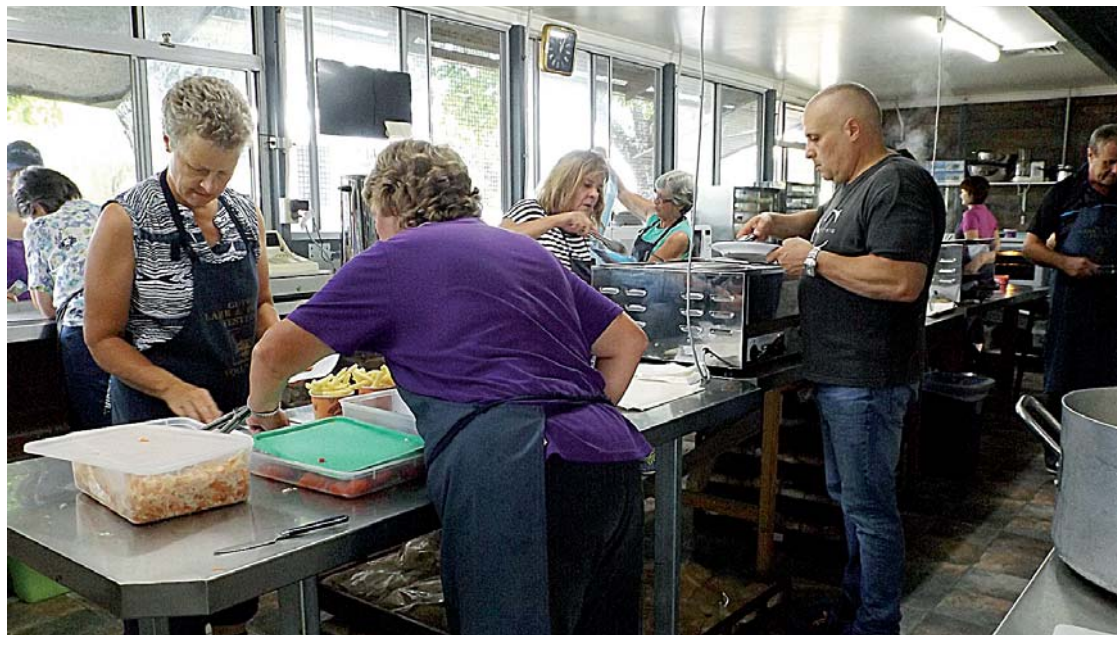
The Guyra Golfing Ladies (and partners) helping out at this year's festival

"People came from everywhere, they just turned up