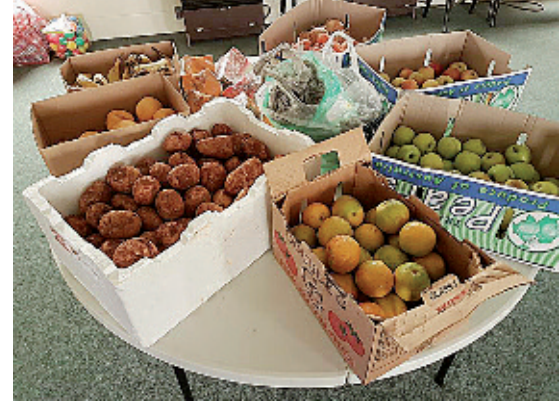
A variety of fresh food is available each Friday

The pantry is open on Fridays between 1pm and 3pm