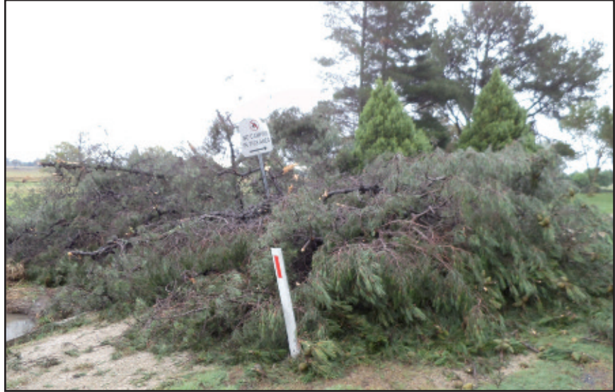
"No camping in this area" Certainly not after the storm on Friday, January 20