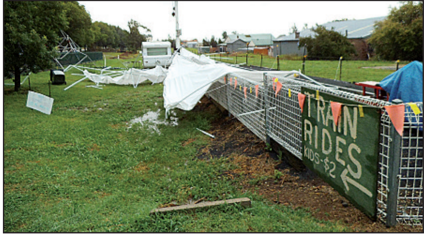
The 'train station' suffered irreparable damage in the stomr