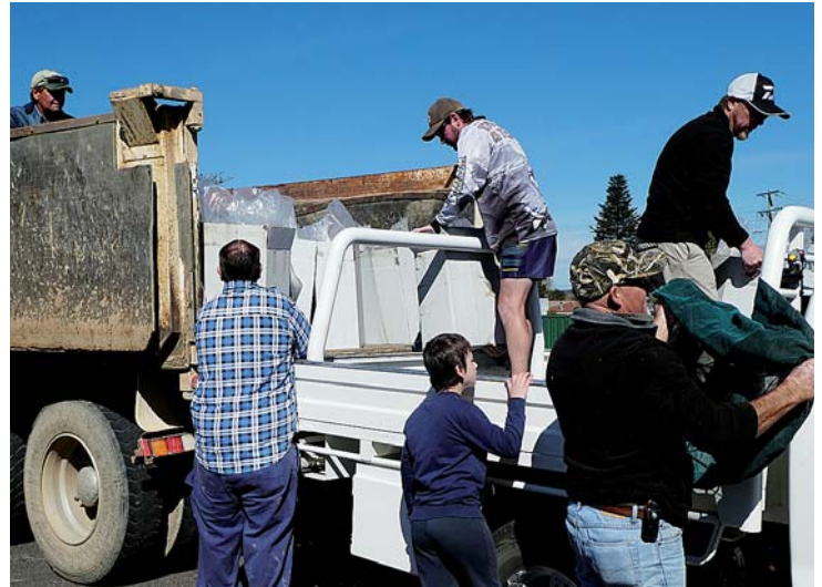
Members of the Guyra Hotel Anglers Club unloading trout fry which will restock local waterways

The Club's next event is its GO FISH day at Malpas Dam on October 15.