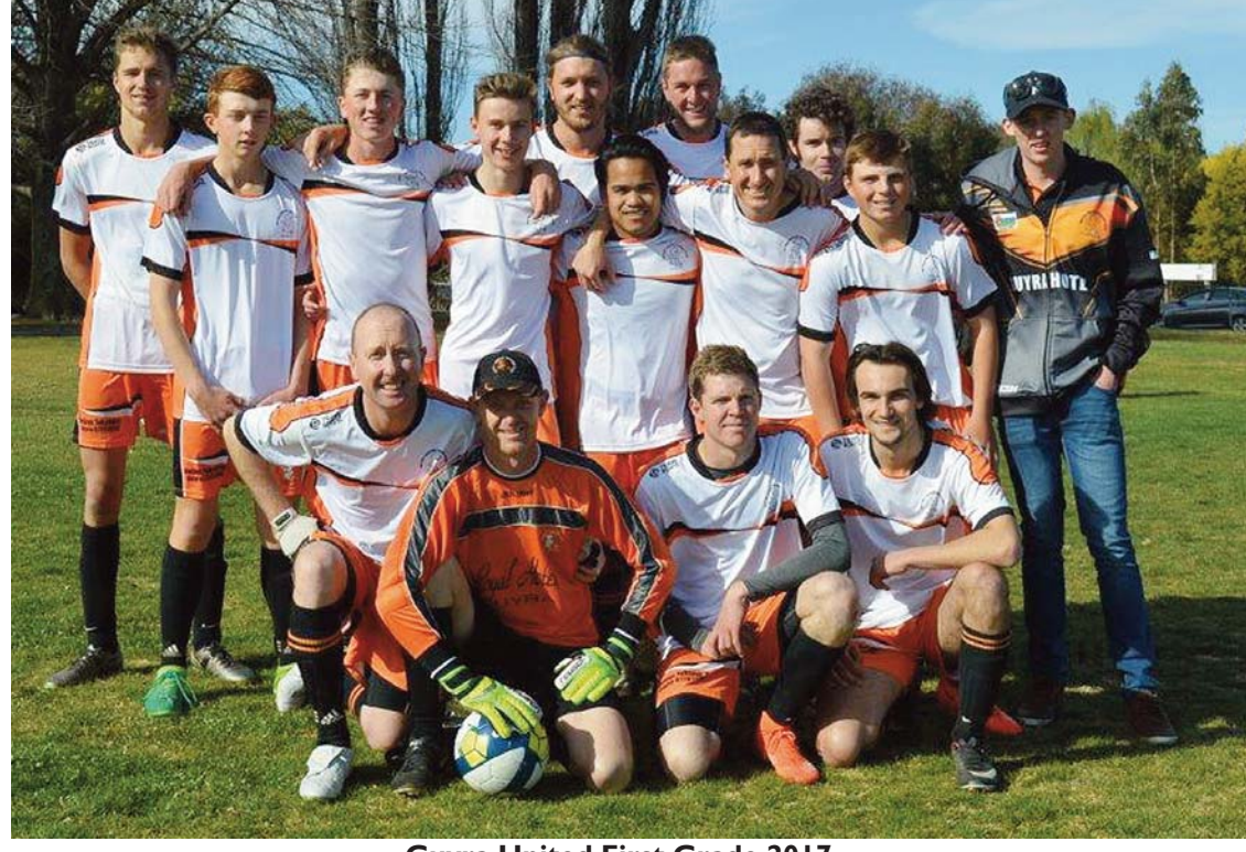
Guyra United First Grade 2017

All in all it was a great season for the both teams who I am sure will be back to go