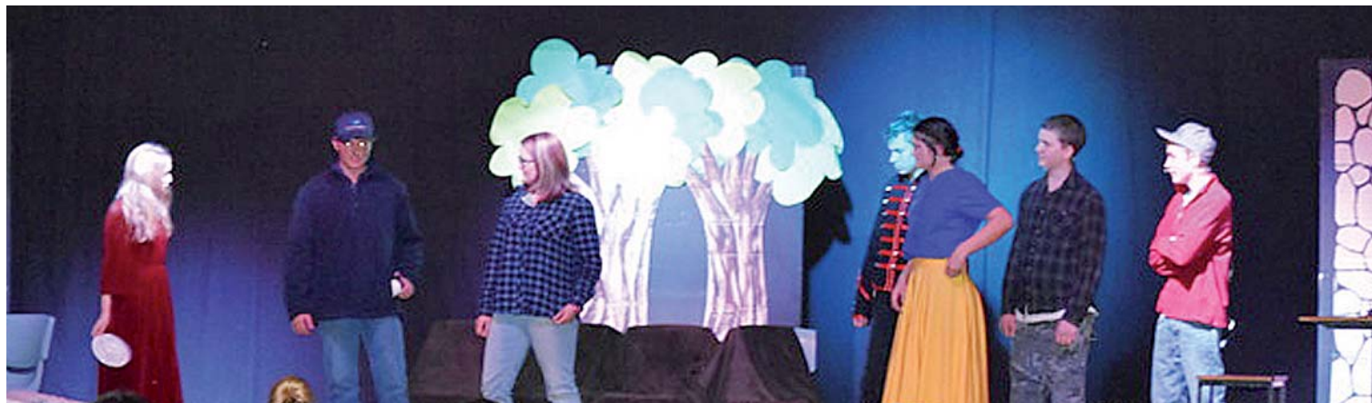
Year 9 English play: Snow White Lite

“I would like to thank the teachers and students for their efforts both on the night and leading up to the Creative Arts night.”