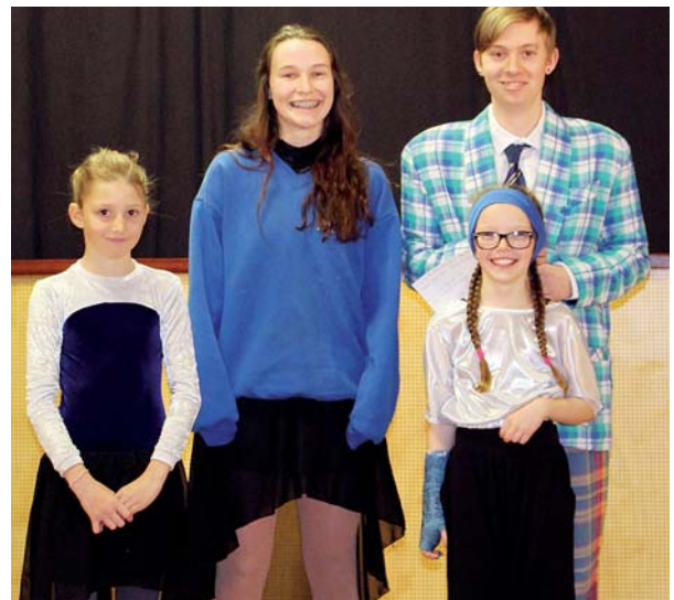
Below right: Wishy Washy Dancers