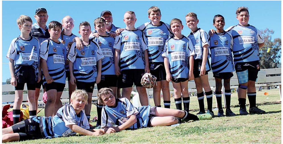
Guyra Under 12s

The junior girls League Tag team had a good win 38-6 against Inverell on the weekend and will be hopeful of a repeat performance in the final. They will be up against Tingha who came out on top in their last encounter. It was a close game with Tingha getting the win 20-18 in the game played at Guyra on August