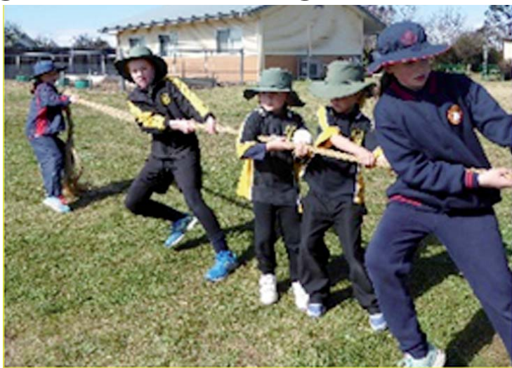
Teamwork in Tug-o-war

Our school also hosts the Highland Fling every year. Schools from the Snow Gums Learning Alliance join us for the event. The theme for this year's Fling was the Highland Games. Students mixed together in different Clans, identified by their tartans, to complete a series of activities. Clans engaged in the Caber Toss, Bulls Eye Throw, Tyre Pull, Horse Shoe Toss, Highland Dancing, Haggis Toss, Sheaf Toss and many