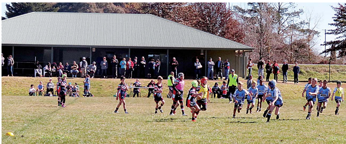
Guyra Junior Rugby League will host the Group 19 semi-finals this weekend at the Lions Park Sporting Complex

with four teams playing in each grade from 10s through to 16s, as well as the Junior and Senior League Tag girls. They are coming from all over and we are looking forward to a great day."