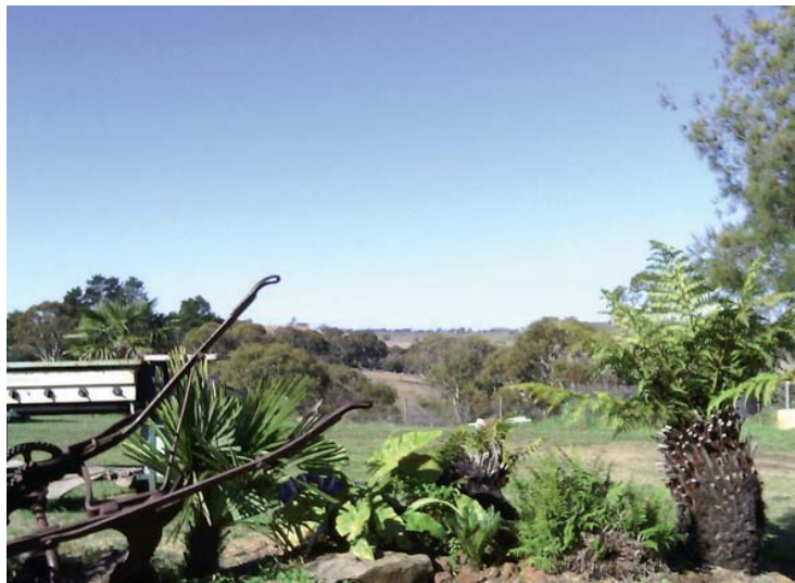
Chinese Palm, Cunjevoi and native ferns: Guyra Plateau 2017

Modern day corridor plantings initiated across New England reinstate old migratory routes for insects, birds and mammals extremely beneficial to the farmer and as plants reproduce along those routes they are becoming beneficial to mankind in the future, helping to re-link the interacting food and en-