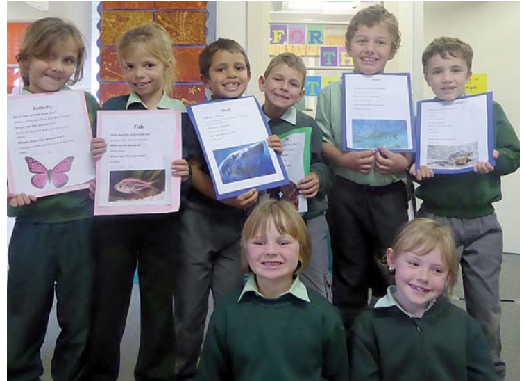
K-2 Class sharing their writing at assembly.