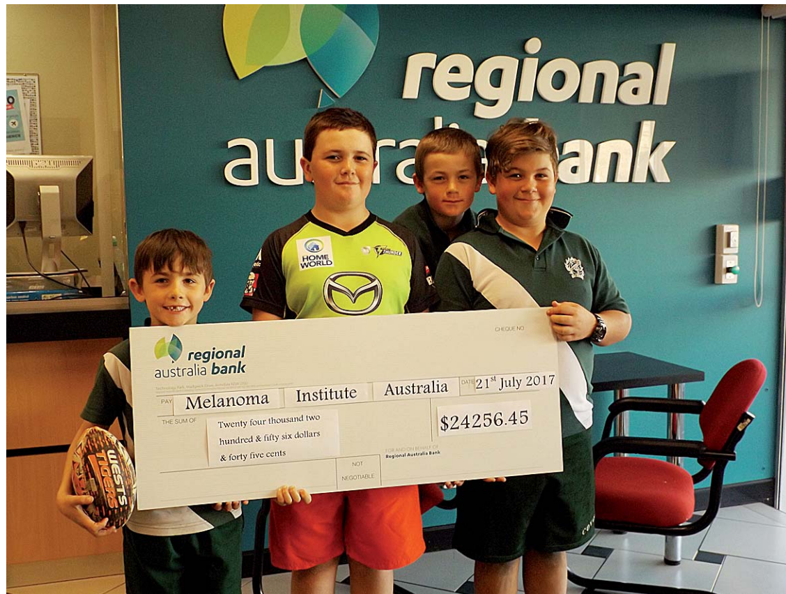
The Five Cent Friday Fundraiser has been officially closed off and a cheque for $24,256.45 has been sent off to the Melanoma Institute of Australia - that is the equivalent of 485,129 five cent pieces!