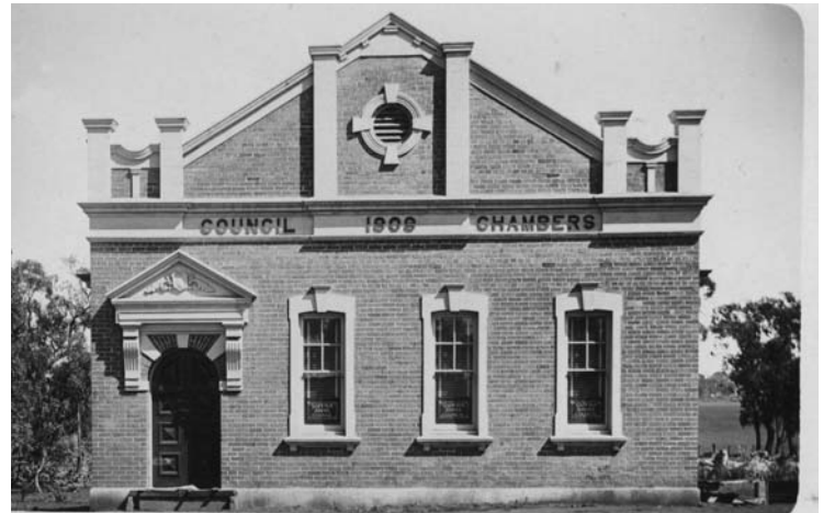
The Guyra Shire Council Chambers (above) built in 1909. The premises were extended in 1954. In 1981 the council moved into new premises. The building was handed over to the Historical Society in 1988 to use as a Museum

“Now that we have had a number of new volunteers put their hands up to staff the museum we hope to be able to open every weekend as well as Wednesday.”