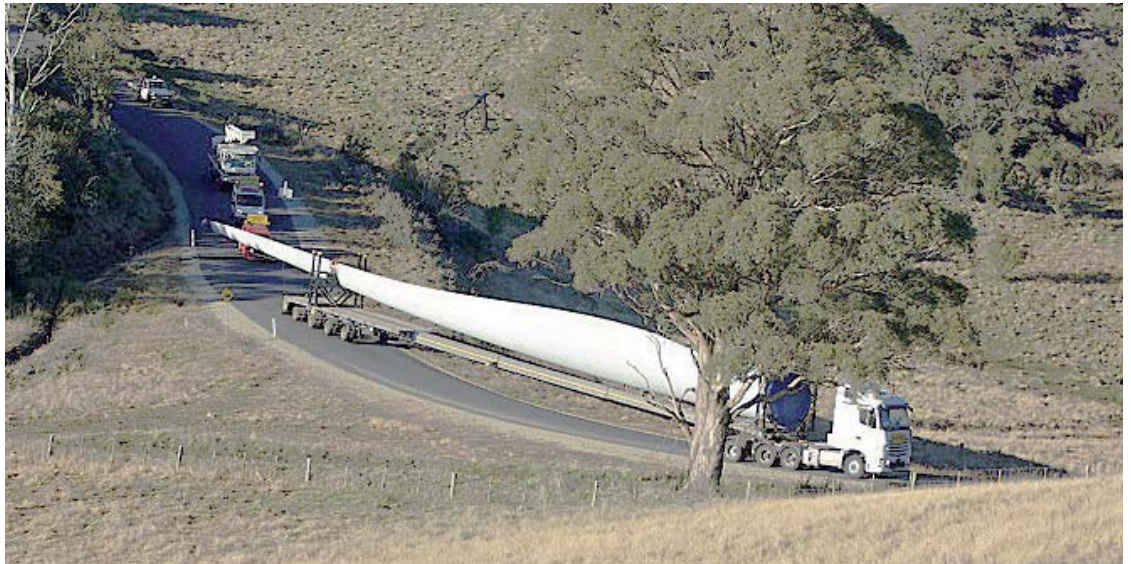
One of the blades negotiating the bend at the foot of the Gap Hill on the Maybole Rd

Residents have reported that there have only been minor delays, with deliveries being timed to avoid peak travel times and school bus schedules.