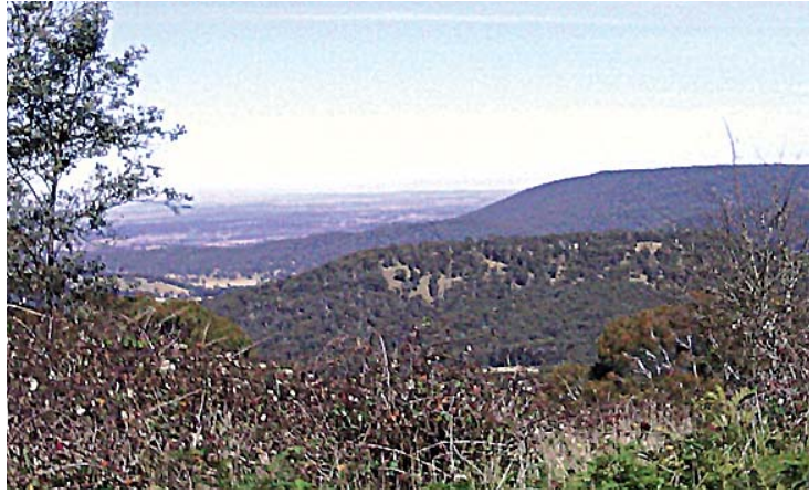
Overlooking Mt Duval and Armidale from Black Mountain.

The landforms throughout Australia's New England, the hills, the valleys, flood-plains, streams or plateaux, speak silently to many of us. Many have heard the call to produce strong stock and/or award winning fibres. Some have tracked down special camping, hiking or fishin' spots, while others have discovered peaceful and colourful locations to paint or photograph.