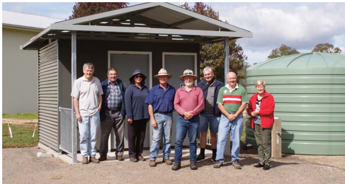
Ebor Community Group at the new Sportsground facilities

Upgrades to the Ebor Sportsground have been completed thanks to funding from Armidale Regional Council and the generous support of the local community.