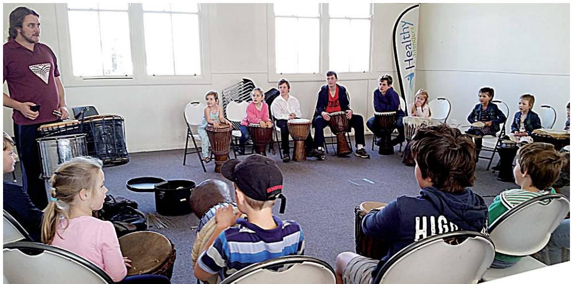
Lots of fun and noise at the Carnival Drumming workshop in Guyra on Tuesday

Armidale Regional Council is hosting a program of school holiday activities for children and young people across the local government area.