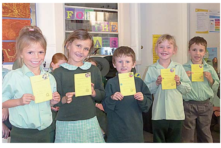
Award winners at school assembly

Student achievements in sport, music, reading, writing, science, mathematics, leadership and other areas of learning were recognised last week at our school assembly. Many parents joined us for our assembly to celebrate student achievement and share in their children's learning. Both junior and senior students shared writing they had completed, employ-