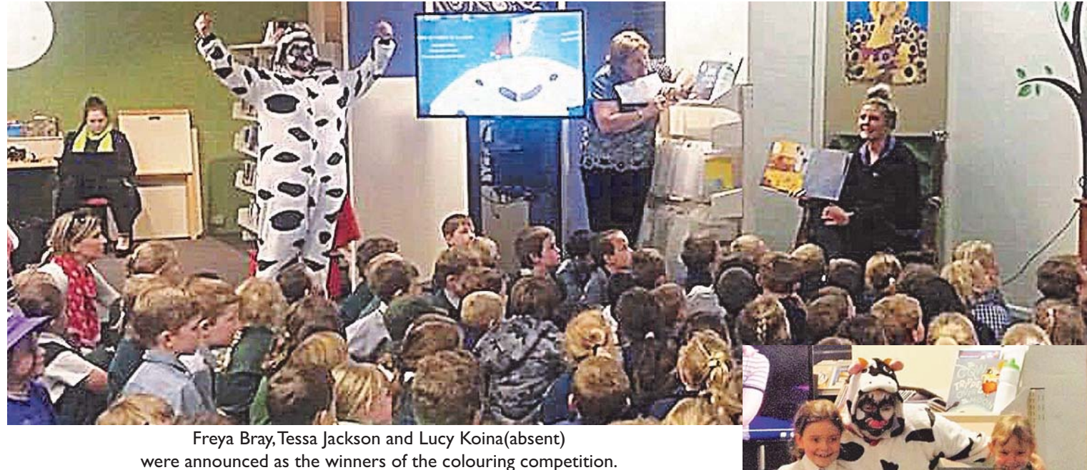
were announced as the winners of the colouring competition.

If you thought libraries were a place to be quiet, then you may want to rethink. Last Wednesday morning there was laughter and squeals of delight as children gathered to take part in National Simultaneous Story-