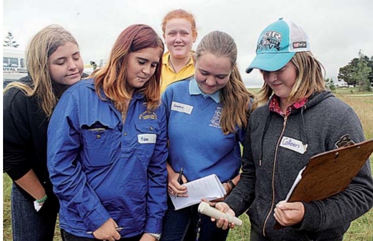
Guyra Central School students take a pH reading to test the acidity levels of the water on-farm at the 2017 Schools Property Planning Competition Field Day.

the information gathered during the property planning field day to prepare a management plan that will maximise profitability and ecological sustainability on Waratah.