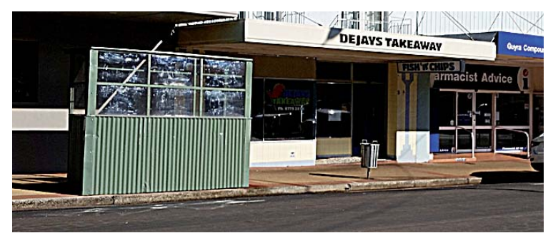
New location for the iconic street stall shelter

gled to collect enough funds to cover the cost of their raffle prize, and is now reconsidering whether it is worthwhile to continue with their fundraising ef-