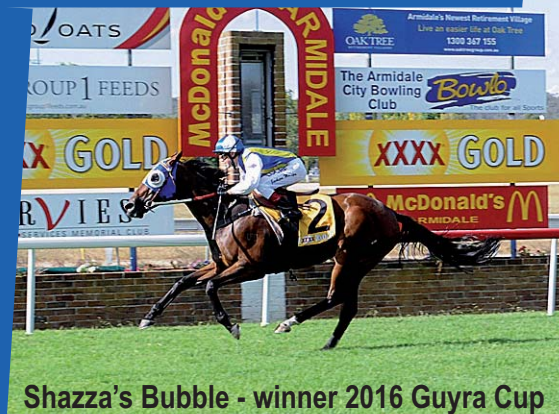
Shazza's Bubble - winner 2016 Guyra Cup