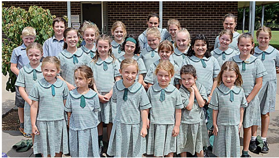
Minnies Vinnies committee

On Tuesday the Mini Vinnies team held their first fundraising event for the year, selling pancakes for Shrove Tuesday. Money