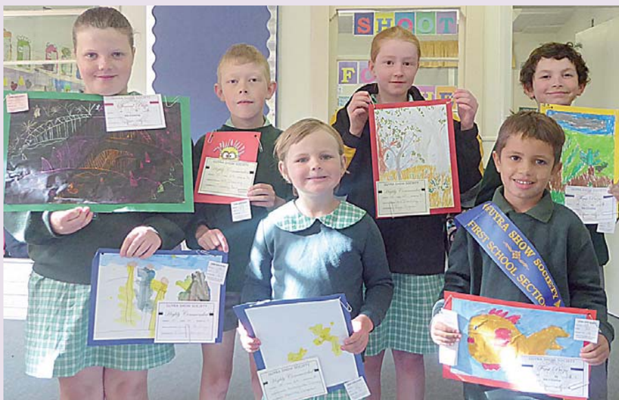
Black Mountain Public School Guyra Show artwork award winners.