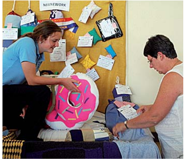
Setting up the display at the Guyra Show on Friday

“I am extremely proud of the work that they have produced and also pleased to see that the next generation is learning these skills and getting enjoyment from their creations.”