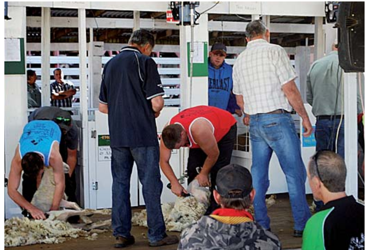
There was plenty of shearing action