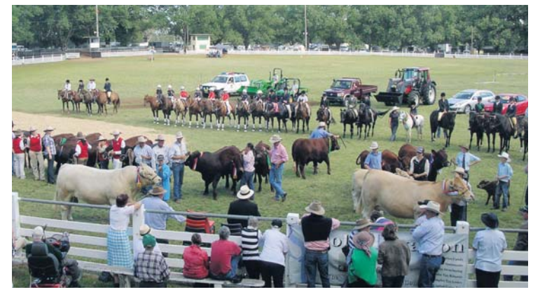
The Supreme Cattle Exhibit will be announced in conjunction with the Grand Parade at the 109th Guyra Show

Action in the cattle ring will start on Friday at 2pm with the junior cattle judging followed by the junior cat-