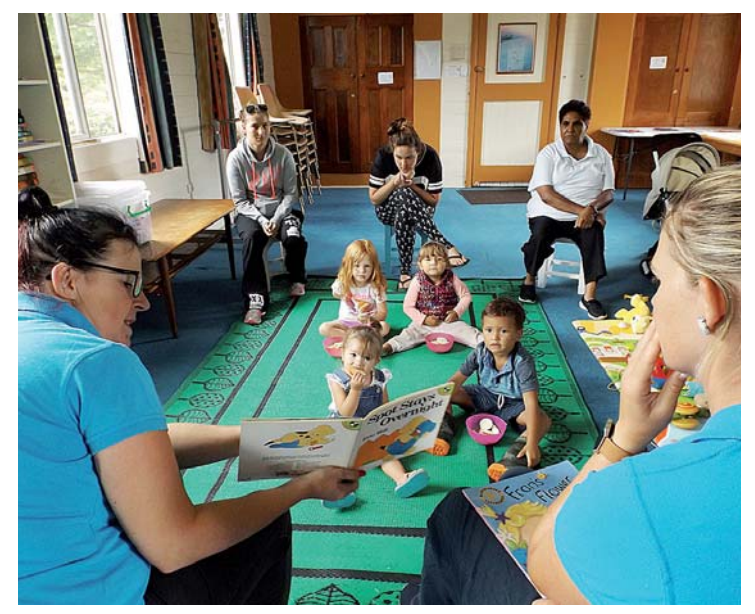
Enjoying morning tea and a story at Gorialla Playgroup

Goorialla Playgroup is a fortnightly playgroup designed specifically for Aboriginal mothers and babies.